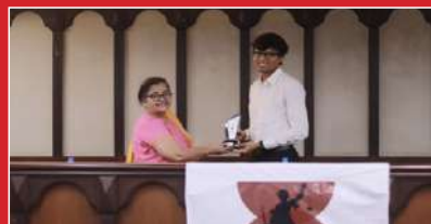
7th Intra Moot Court Competition, 2022 (Moot court committee)