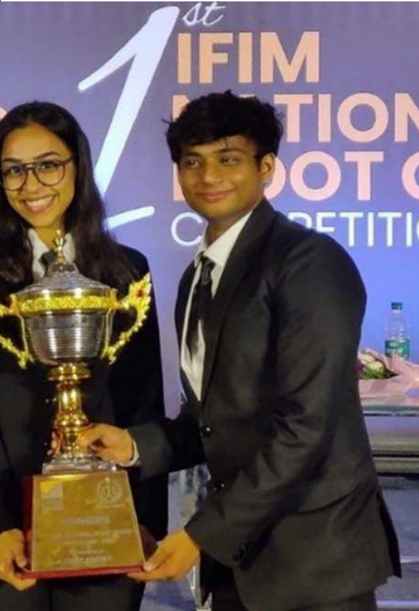
IFIM National Moot Court Winner 2021-22