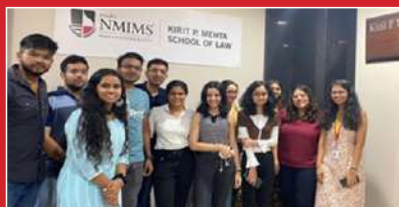
Webinar on "Research and Publication Strategies for UGC Care List Journals" (Centre for Excellence)