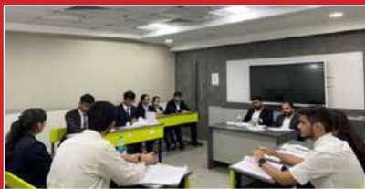
4th Intra Mediation Competition 2022 (ADR committee)