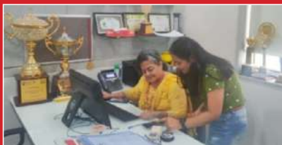
National Twitter Conference (Cyber Cell)