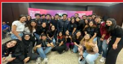
14th edition of Times Fresh Face Auditions (Merarki –Times Group)