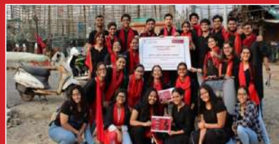
Parakram Fiesta (Sports Squad)