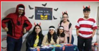
Halloween (Cultural Committee- Meraki)