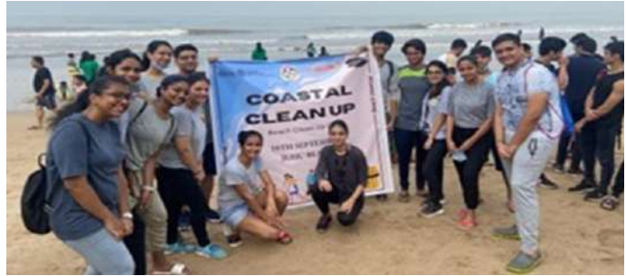
Sports Squad (Beach Clean-up Drive)