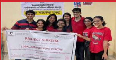
Village Adalat (Legal Aid Clinic & Support Centre)