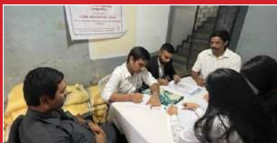
Legal Aid Clinic & Support Centre (Street Play)