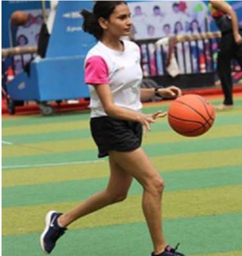
Sports Squad (Parakram)