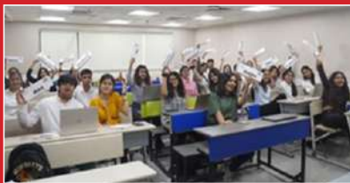
The 4th Intra Model United Nations Competition, 2022 (Model United Nations Society (MUNSOC))